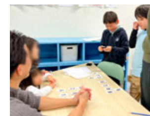
"Can you solve this number magic trick?" Students explained it in their own words while engaging with visitors—sharing the fun of learning.

The opportunity to share their story with the world in their own words was an honorable and deeply meaningful experience—one that became a great source of pride for the students. Throughout the preparation and execution of the event, they developed skills such as collaboration, perseverance, and a strong sense of self-efficacy—"I did it myself!" Their experience at the Expo was a unique learning journey, leaving a lasting impression that could never be gained solely within the classroom.