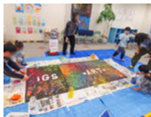
Visitors freely participated in this collaborative art activity. The Expo is a space not only for sharing learning, but for creating together.