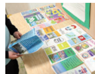
Grade 3 students created handmade pamphlets introducing the charms of Shikoku. They researched regional culture and practiced expressing it in English.