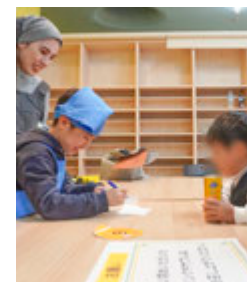
A student-run café booth that explained the difference between fresh and store-bought juice using handmade posters and a taste comparison set.