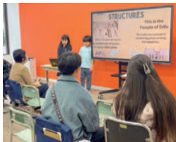
Students gave presentations using slides to share what they had researched about ancient Egyptian temples and writing.