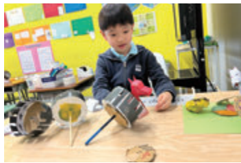
"Illusion toys" themed around the mystery of perception were on display. Through creating these pieces, students nurtured both their imagination and expressive abilities.

Grade 1 focused on the theme of Health and Wellbeing, offering visitors yoga activities and quizzes to explore the importance of balancing body and mind. Grade 2 expanded on the IPC unit Magic ToyMaker, creating booths that introduced toys and games from around the world. One booth even showcased failed prototypes, highlighting the value of both challenge and choice. Grades 3 and 4 based their projects on Temples, Tombs and Treasures, an exploration of ancient civilizations. Their exhibits and presentations allowed visitors to experience aspects of ancient Egyptian culture and writing. Visitors were drawn into the world of learning through history quizzes and writing experiences.