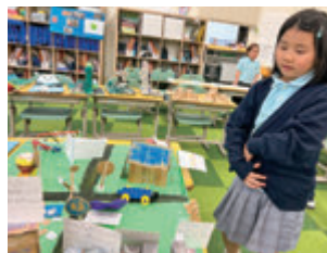
A student observes the displays of other grades with great interest. Sharing learning often leads to new discoveries and insights.

Wellbeing.” This integrated their learning about emotional self-regulation (Health and Wellbeing), physical expression using yoga (PE), and global wellness culture (International), creating a space where students could communicate in their own words with visitors. This kind of integrated learning embodies IPC’s vision of a “connected understanding.” By the end of the Expo, students carried a sense of pride and confidence that could not have been gained simply by conveying knowledge. As they carefully chose words, responded to questions, and engaged in trial and error, they developed a strong sense of “I did it” and “I got my message across.” Teachers who guided them through this process said they hope to further cultivate students’ abilities to “express their ideas in a way that reaches others” and to “collaborate and refine their work with peers.” The Expo is not a one-day event—it is a vital process that becomes the foundation for continued learning and future challenges. The students will continue to expand their horizons and strengthen their ability to communicate. And we, as educators, will continue to support them so they can grow into lifelong learners who keep exploring and discovering for the next 100 years.