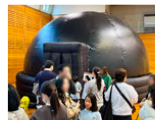
A mobile planetarium set up for the screening of Bulldog Tantei to Kieta Hoshi. Many visitors came specifically to enjoy the show.